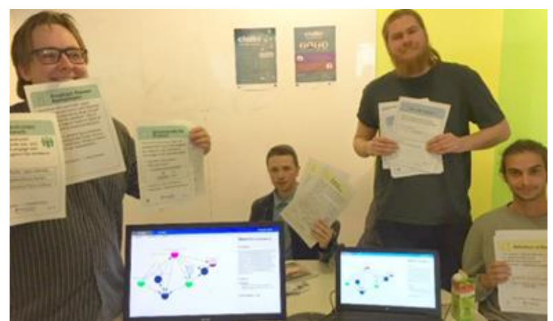
Figure 2. A project team showing their practice cards

In this fashion, the teams were introduced to both the progress control aspect of Essence and its methodagnostic philosophy during the course. After the introduction of the practice cards, the use of Essence was not enforced during the project work and there were no regular check-ups to confirm its utilization. Full and correct utilization of Essence was not mandatory, and its utilization or lack thereof did not affect the grades given to the teams. All teams were instructed to utilize it to what extent they felt they could, but this was not supervised in practice. This approach was chosen to gather more unbiased data on the possible barriers of adoption in the case of Essence.